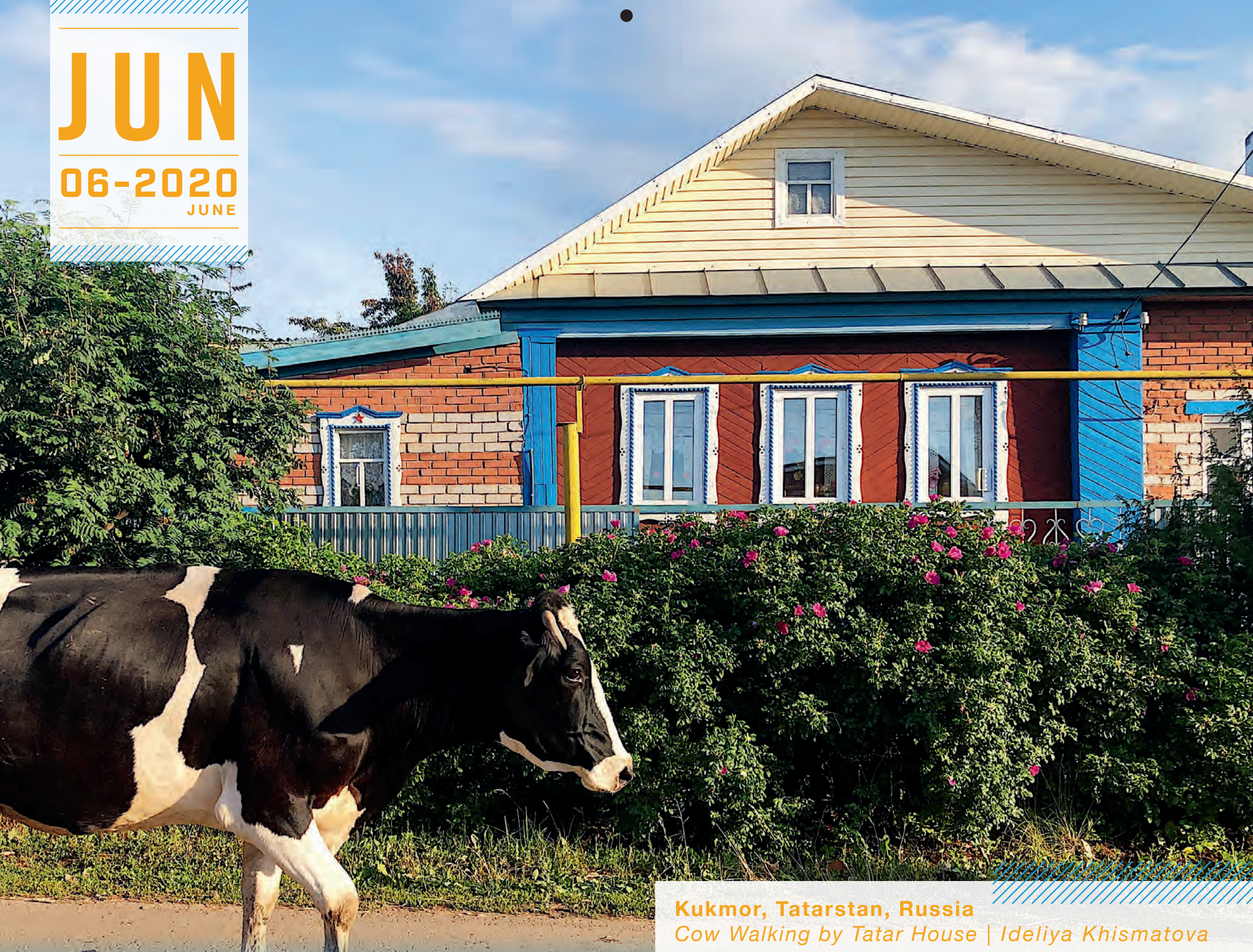
Kukmor, Tatarstan, Russia Cow Walking by Tatar House